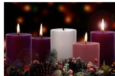
3 rd Week of Advent - Love